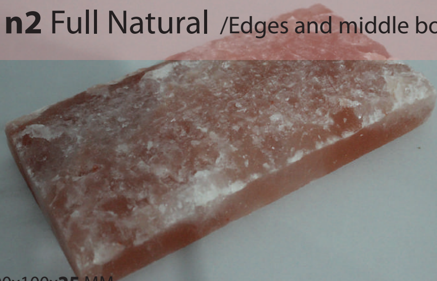
200x100x 25 MM