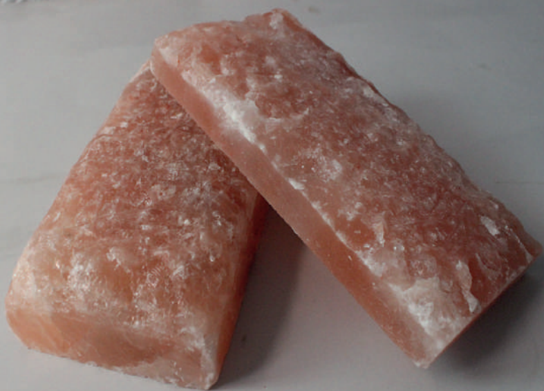
200x100x 50 MM