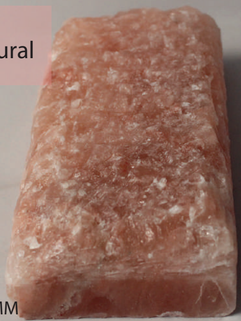
200x100x 50 MM