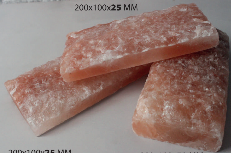
200x100x 25 MM